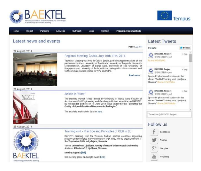
Figure 1: BAEKTEL website

However, application and development of OER materials faces certain difficulties. Some of the issues are how to secure the quality of OER content, and how to sustain long-term interest for development of OER materials. Thus Koppi and Lavitt [9] state that one of the reasons for the lack of motivation among the teaching staff regarding OER development can be found in absence of institutional valuation. Hence they suggest that appropriate credits should be awarded for contribution to OER development. Having in mind all the advantages of OER materials, as well as the need to make free educational content available, a number of Western Balkans and EU universities gathered around the idea of creating BAEKTEL project (Blending Academic Entrepreneurial Knowledge in Technology Enhanced Learning). Universities from Serbia, Montenegro, Bosnia and Herzegovina, Italy, Slovenia and Romania are taking part in this project (www.baektel.eu - Figure 1). The aim of the project is to create OER materials in different areas which will create a connection between university knowledge (theoretical knowledge) and practical (applied) knowledge needed for working in the industry. To that end, educational materials in electronic form will be created, which will be publically available at no cost to the end user. In this task all advantages of information technologies will be used in order to present materials in a meaningful way, by satisfying basic pedagogical-didactic criteria.