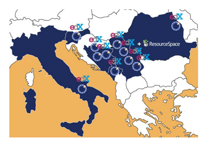
Figure 4: Distribution of BAEKTEL resources

As mentioned earlier, for a richer user experience, it was important to use the most interactive and the most user friendly learning platform. After examining the most popular learning platforms, we found that edX platform (http://code.edx.org/) created by MIT offers by far the richest and most interactive user experience, compared to the other two most popular open source learning platforms (OpenMOOC and Moodle). Hence a network of edX nodes spread throughout partner countries, together with the ResourceSpace platform form the core of the BAEKTEL framework, as depicted in Figure 4.